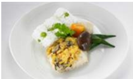
Grilled Sea Bream Kenchin Style (KIXD)

With bekko sauce, steamed rice and Japanese-style vegetables.