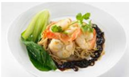
Stir Fried Egg Noodles with Seared Prawns (AUSE)

Braised chicken in curry gravy, served with steamed rice and sautéed mixed vegetables in turmeric and mustard seed.