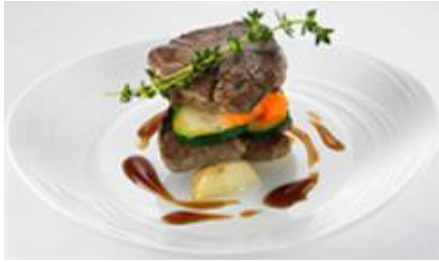
Grilled Fillet of Beef with Balsamic Gravy (NRTA)

Served with roasted potatoes, sautéed zucchini and carrots.