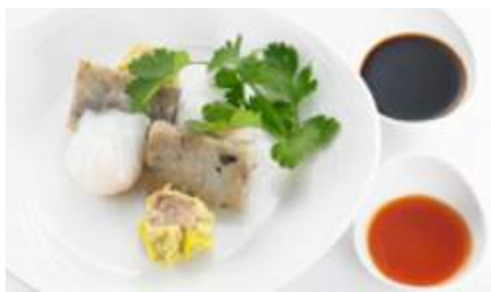
Assorted Dim Sum (PEKA)

Prawn dumpling, chicken siew mai and yam cake, with chilli and soya dipping sauce.