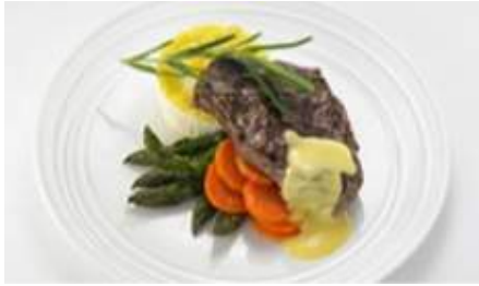
Grilled Rib Eye of Beef (LHRA)

Grilled rib eye of beef, served with potato soufflé, asparagus, carrots and hollandaise sauce.