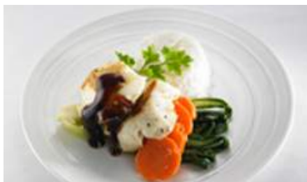
Pan Fried Silver Cod with Soya Glaze (KULE)

Braised beef rib in demi glaze to perfect doneness. Accompanied with creamy mashed potatoes infused with crushed roasted garlic. Served with caramelized apple wedge and roasted vegetables.