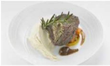
Grilled Beef Tenderloin with Mushroom Sauce (PVGA)

Served with lime-mashed potatoes, sautéed zucchini, buttered carrots and grain mustard.