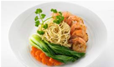
Wok Fried Egg Noodles (AKLD)

Braised fillet of monk fish in hot and sour gravy, complemented with steamed jasmine rice and sautéed green beans.