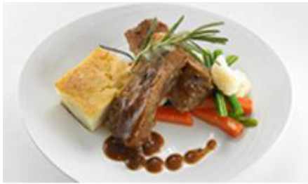
Braised Beef Ribs with vegetable Medley (AUSA)

Braised beef ribs in peppered sauce, accompanied by potato au gratin and medley vegetables.