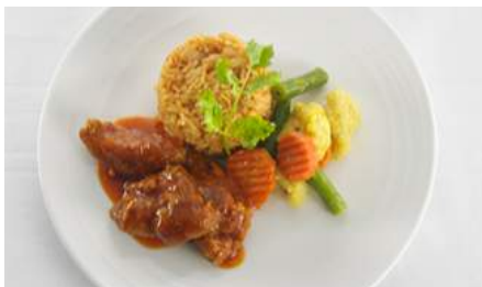
Ayam Masak Merah (LHRD)

Mediterranean styled braised lamb shank. The lamb has been seasoned with just salt and black pepper, rubbed with pesto, seared to seal and then braised. It is served with horseradish mash, tomato and a drizzle of lamb jus.