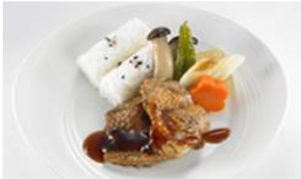
Sansho Pepper Grilled Chicken (NRTB)

Served with roasted potatoes, sautéed zucchini and carrots.