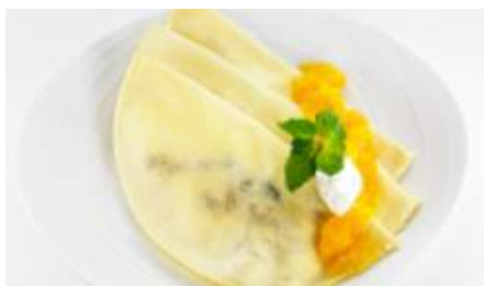
Cream Cheese Stuffed Crepe with Raisins (PEKD)

Accompanied with grilled chicken sausage, lyonnaise potatoes, sautéed mushrooms and grilled tomato.