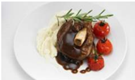
Braised Lamb Shank (LHRC)

Braised lamb cubes in biryani spices served with biryani rice and vegetables acar.