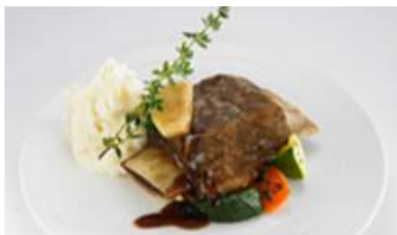
Beef Rib with Apple & Demi Glaze (KULD)

Parchment baked grill cod infused in its juices with Kipfler potatoes, cherry truss tomatoes, green and black olive halves, pesto oil and grapes. The aroma of its presence need say no more.