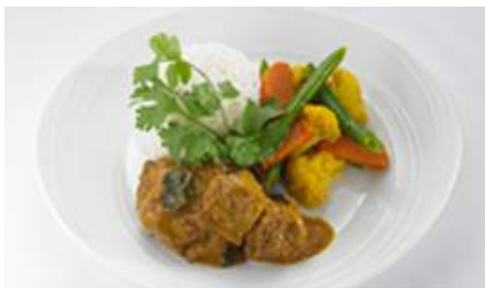
Braised Chicken in Curry (AUSD)

Steamed fillet of barramundi, served with steamed rice, roasted pumpkin, wilted spinach and teriyaki sauce.