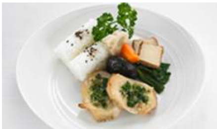
Grilled Japanese Bluefish "Nanban-style" (NRTE)

Served with steamed rice and Japanese-style vegetables.