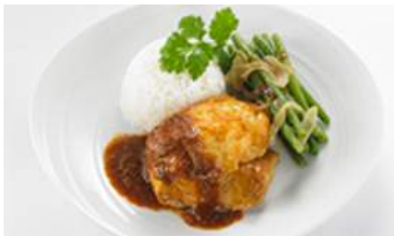
Asam Pedas Fish (AKLC)

Braised cubes of chicken thigh in light curry gravy infused with lemongrass, galangal and turmeric. Accompanied with steamed rice and Asian greens.