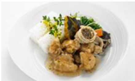
Fried Chicken with Grated Radish Sauce (NRTC)

With steamed rice and Japanese-style vegetables.