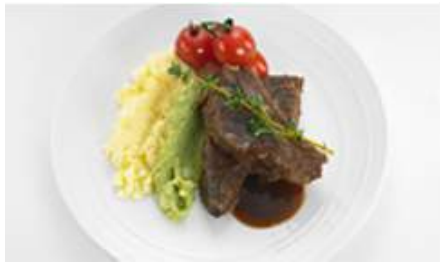
Beef Cheek with Polenta and Vegetables (KULB)

Mediterranean styled braised lamb shank. The lamb has been seasoned with just salt and black pepper, rubbed with pesto, seared to seal and then braised. It is served with creamy garlic mashed, tomato and a drizzle of lamb jus.