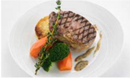
Grilled Rib Eye of Beef (AKLA)

Grilled rib eye of beef served with potato pancake, broccoli florets, turned carrots and black pepper sauce.