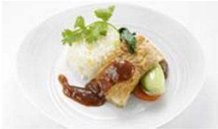
Pan Fried Fillet of Fish in Hot Bean Sauce (PVGB)

Served with lime-mashed potatoes, sautéed zucchini, buttered carrots and grain mustard.