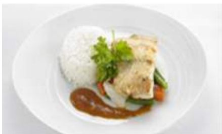
Fillet of Fish with Sambal Sauce (PVGC)

Paired with egg fried rice and mixed vegetables.