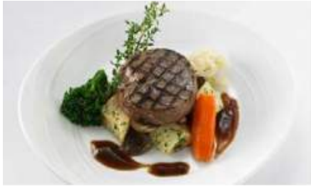
Grilled Fillet of Beef with Mustard Sauce (KIXA)

With parsley fried potatoes, sautéed mixed mushrooms, broccoli, carrots and cauliflower.