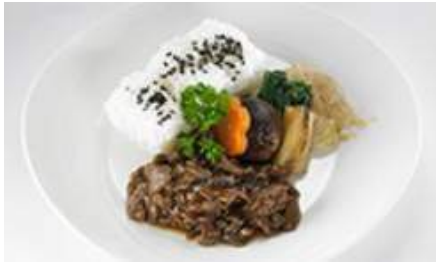
Beef Sukiyaki (KIXB)

With parsley fried potatoes, sautéed mixed mushrooms, broccoli, carrots and cauliflower.