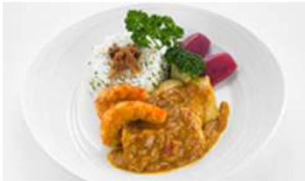
Seafood Coconut Curry (NRTD)

Served with steamed rice, shimeji mushrooms, pumpkin and simmered carrots.