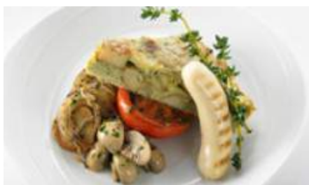
Pesto Egg Frittata (PEKC)

Served with fried rice and seasonal vegetables.