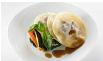
Oxtail Ravioli with Garlic Jus (AKLE)

Wok fried egg noodles with garlic oyster sauce, served with seared prawns, baby pak choy and carrots.