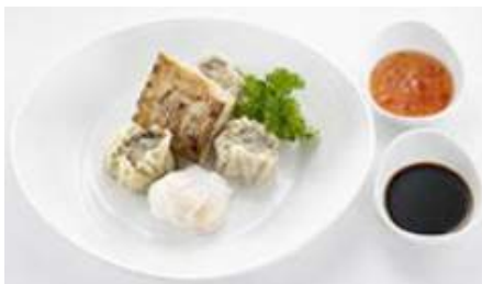
Assorted Dim Sum

Served with steamed rice and green beans.