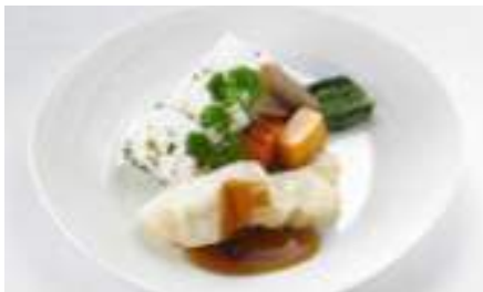
Sautéed Filefish (KIXC)

With steamed rice, simmered Japanese vegetables and sukiyaki sauce.