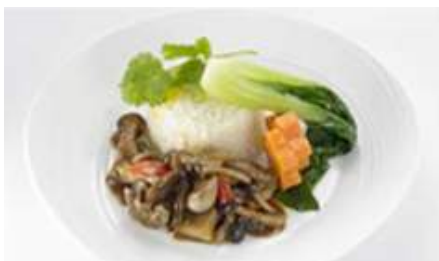
Wok Fried Assorted Mushrooms with Soya Sauce (PVGE)

Prawn dumpling, chicken siew mai, fish siew mai and radish cake, with chilli and soya dipping sauce.