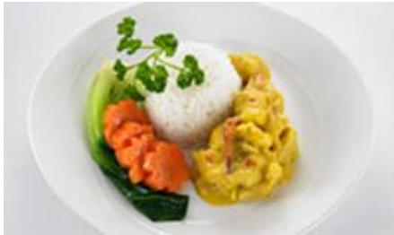
Chicken Curry Kapitan (AKLB)

Grilled rib eye of beef served with potato pancake, broccoli florets, turned carrots and black pepper sauce.