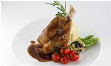
Braised Lamb Shank (KULA)

Mediterranean styled braised lamb shank. The lamb has been seasoned with just salt and black pepper, rubbed with pesto, seared to seal and then braised. It is served with creamy garlic mashed, tomato and a drizzle of lamb jus.