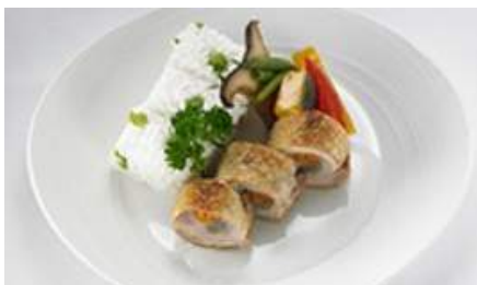
Grilled Chicken Roll with Vegetable Yahata-style (KIXE)

With green peas rice and simmered Japanese-style vegetables.