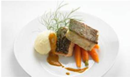
Salmon and Cod Duo (AUSB)

Braised beef ribs in peppered sauce, accompanied by potato au gratin and medley vegetables.