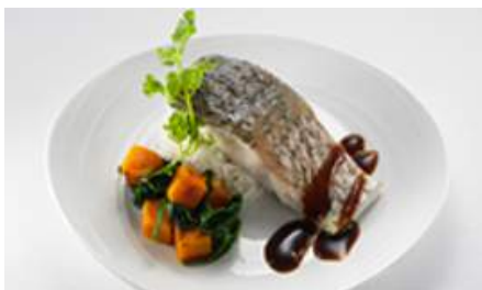
Steamed Barramundi with Teriyaki Sauce (AUSC)

Seared fillets of salmon and cod, accompanied with wasabi-infused mashed potato, baby carrots and lobster sauce.