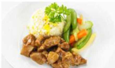
Wok Fried Chicken with Mushrooms in Soya Sauce (PEKB)

Prawn dumpling, chicken siew mai and yam cake, with chilli and soya dipping sauce.