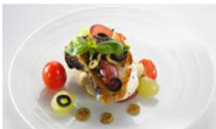
Cod Papilote (KULC)

Complemented with jus, soft polenta, peas puree and tomato.