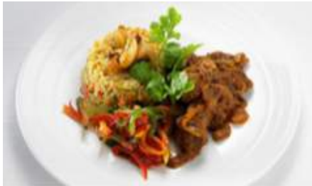
Lamb Biryani (LHRB)

Grilled rib eye of beef, served with potato soufflé, asparagus, carrots and hollandaise sauce.