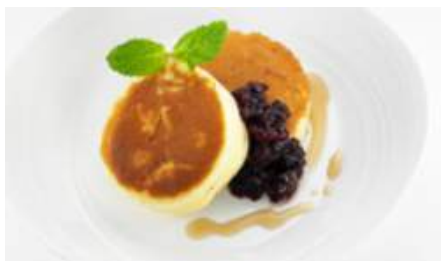
Stuffed Pancake with Peach (PEKE)

Paired with orange compote and a dollop of cream.